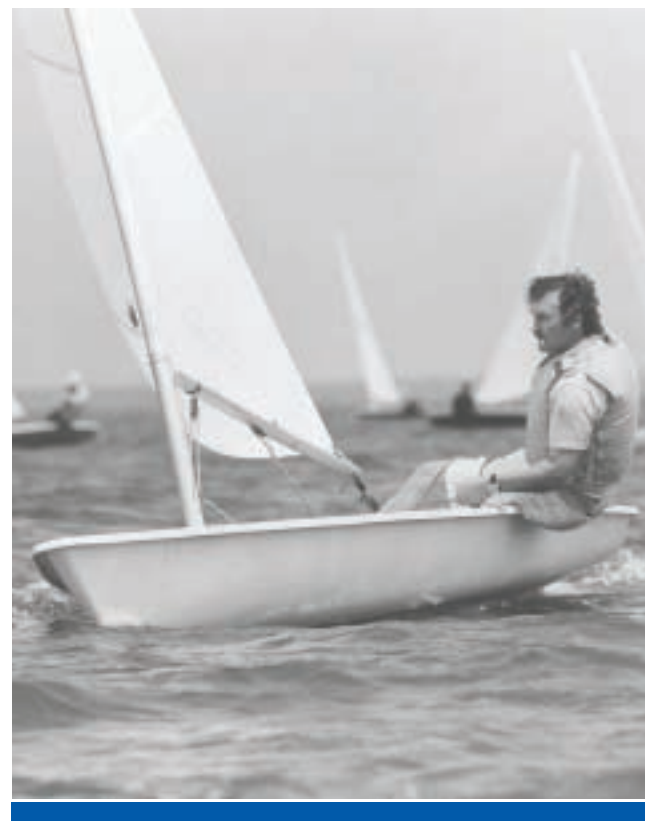
Bruce Kirby winning the fourth race of the U.S. Nationals in 1975, when 116 boats competed. It was held in Barnegat Bay, New Jersey.

Although Bruce is not as lithe a sailor as he was in days past, he may only now be hitting full stride at the drafting table. “There’s a lot of stuff that’s crammed in my old headbone that’s paying off now,” he says. “Your eye gets better at it, so that you’re more likely to draw the boat right the first, second or third time rather than keeping at it for weeks before it looks right.”